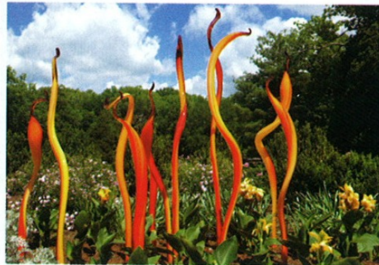
Dale Chihuly, Amber Cattails, 2010, Cheekwood Botanical Garden & Museum of Art, Nashville, Tennessee.