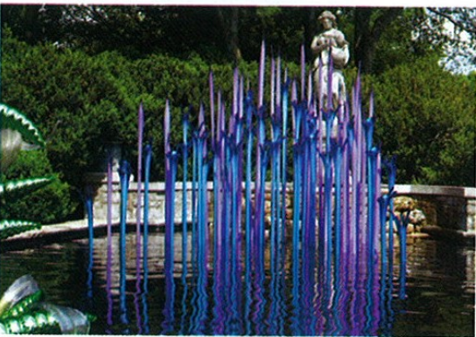
Dale Chihuly, Blue Fiddleheads and Neodymium Reeds 2010, Cheekwood Botanical Garden & Museum of Art, Nashville, Tennessee.