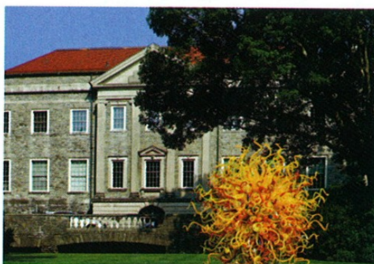
Dale Chihuly, The Sun, 2010, Cheekwood Botanical Garden & Museum of Art, Nashville, Tennessee.

"I am less concerned with being narrative or figurative. I am involved in the glass and the light that passes through it – the phenomenon of light being transmitted through colored glass." – Dale Chihuly